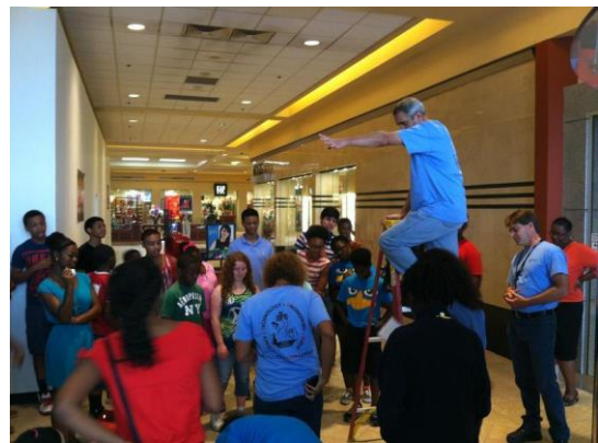
Newport News Public School students participate in an Egg Drop event with Newport News Shipbuilding at the Youth Career Café.