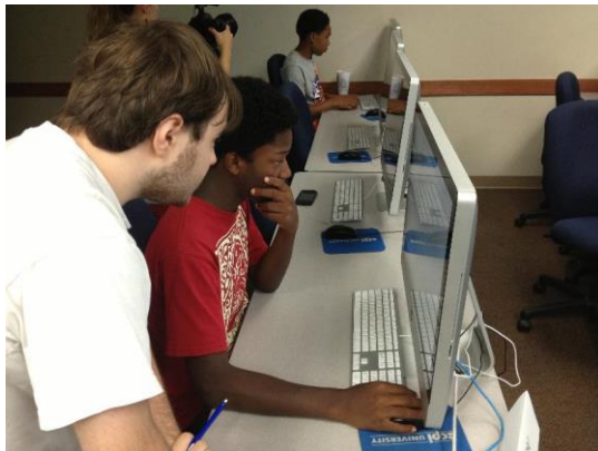
Students participate in the Peninsula Council's app development summer camp at ECPI University in Newport News.

Visit www.youthcareercafe.com for the latest information and coming in early September a Summer in Review edition of Cafe411 . Check out the pictures below for a highlight of some of our summer fun at the Café!