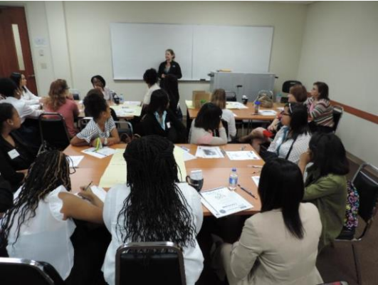
Bethel High School students participate in the Spring "Girls Get IT".

Completing its ninth year, the Financial Services Academy at Heritage High School was attended by 40 students interested in learning more about everything from money and banking to ethics and law. Financial Services Cluster members who participated this year included BayPort Credit Union, BB&T, 1st Advantage Federal Credit Union, Old Point National Bank, Transamerica Life Insurance Co., XpressCPA, Wells Fargo & Virginia Educators Credit Union.