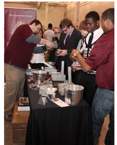
Employees from the Newport News Shipbuilding Apprentice School demonstrate hands on activities with EXPO participants.