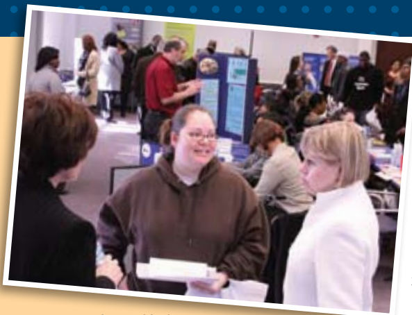
The Peninsula Worklink's Empowering the Community Resource Fair assisted more than 250 people in February who were seeking employment.