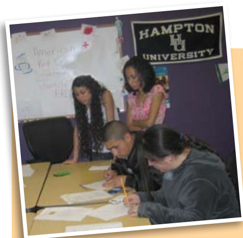
Denbigh High School youth plan a budget during a session at the Youth Career Café.

Through SEVA-PORT funding, the cities of Newport News and Hampton each sponsored an internship program during the 2009-2010 school year which exposed students to cutting-edge career pathways. The Newport News group learned about the logistics of moving water throughout the city, which introduced them to STEM. The Hampton students' program focused on the workings of the M&S industry.